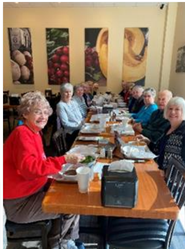
Dining Out Together