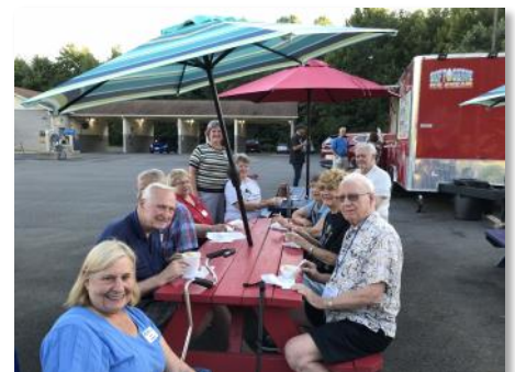
Ice Cream Socials