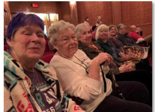
Movies at Mt. Pony