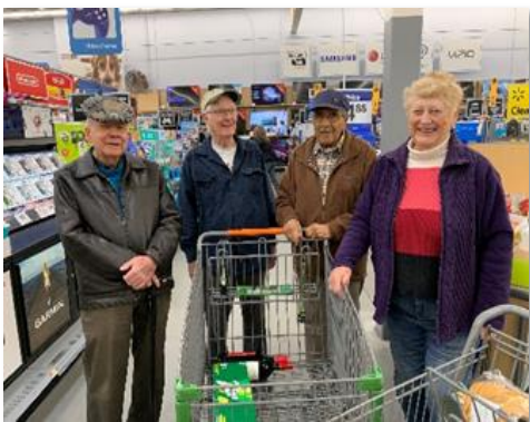
Walking at Walmart