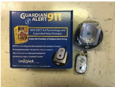
LOWLINC donated 10 Guardian Alert pendants to Orange County TRIAD, using the McMurtry Award funds.

It has been a privilege to have the opportunity to explore ways to benefit health and wellness in our community through donations from the McMurtry Award. Some of the items purchased have the potential to change or save a person's life. Expenditure of the funds is going fast, but for very worthwhile purposes.